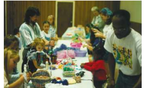
Easter Basket crafting contest (above)