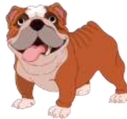
HARRIS ELEMENTARY SCHOOL

The Drive a Senior offices for the Northeast side of Austin are also located in our office suite. If you have even 2-3 hours a week, you might just be helping someone stay in their home by being available to give them a ride to the doctor or other appointment. These services are vital for many of our neighbors. Go to www.volunteerdriving.com to find out more and see how you can help!